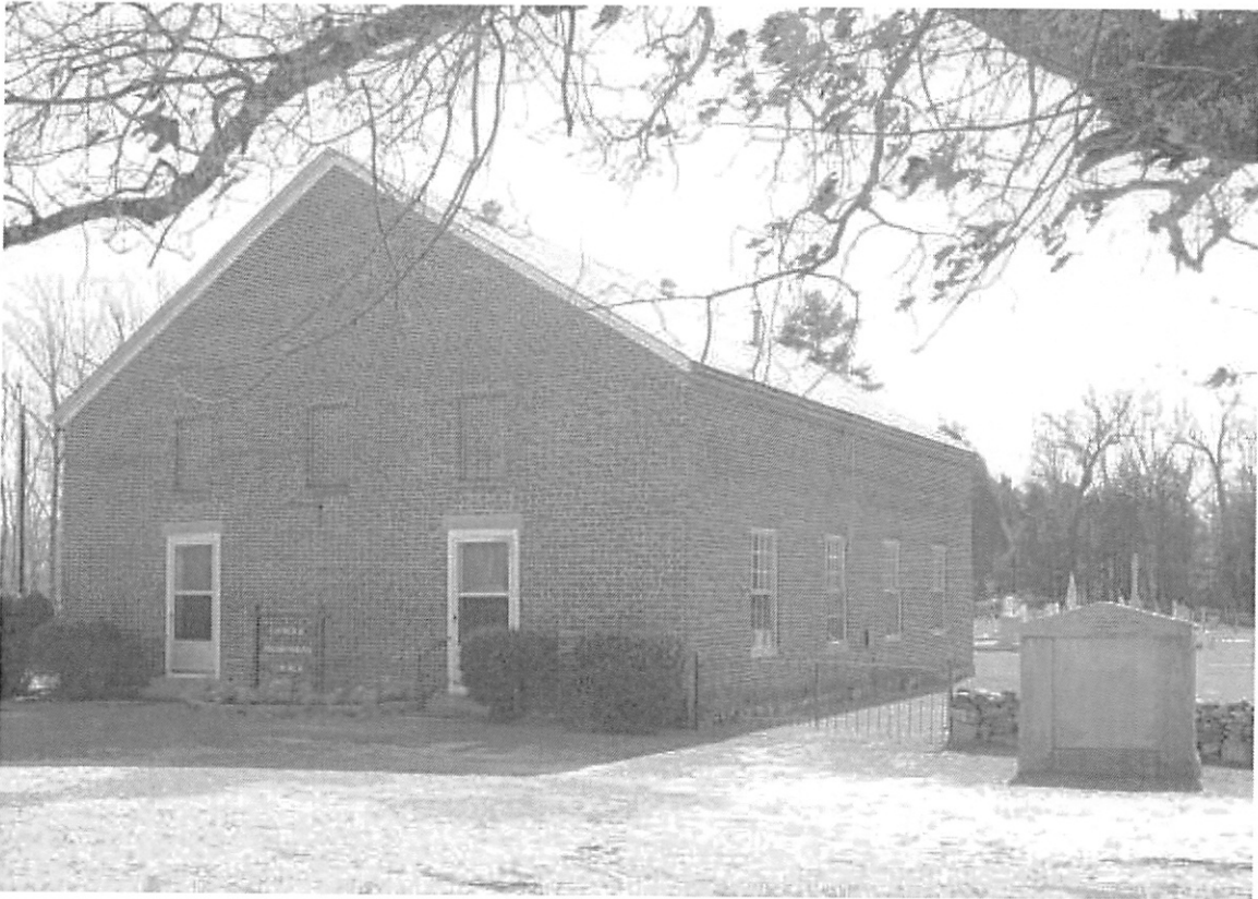
→ CATHOLIC PRESBYTERIAN CHURCH